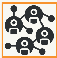
OSINT AND SOCIAL MEDIA