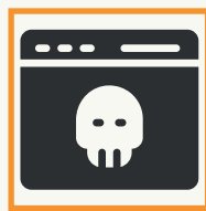
DARKNET AND BLOCKCHAIN