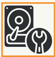
DAMAGE MEDIA RECOVERY