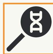
ON-SCENE CRIME FORENSICS